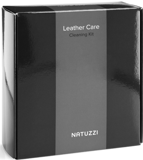
■ J009PX0 (1 pcs) / K009PX0 (20 pcs)