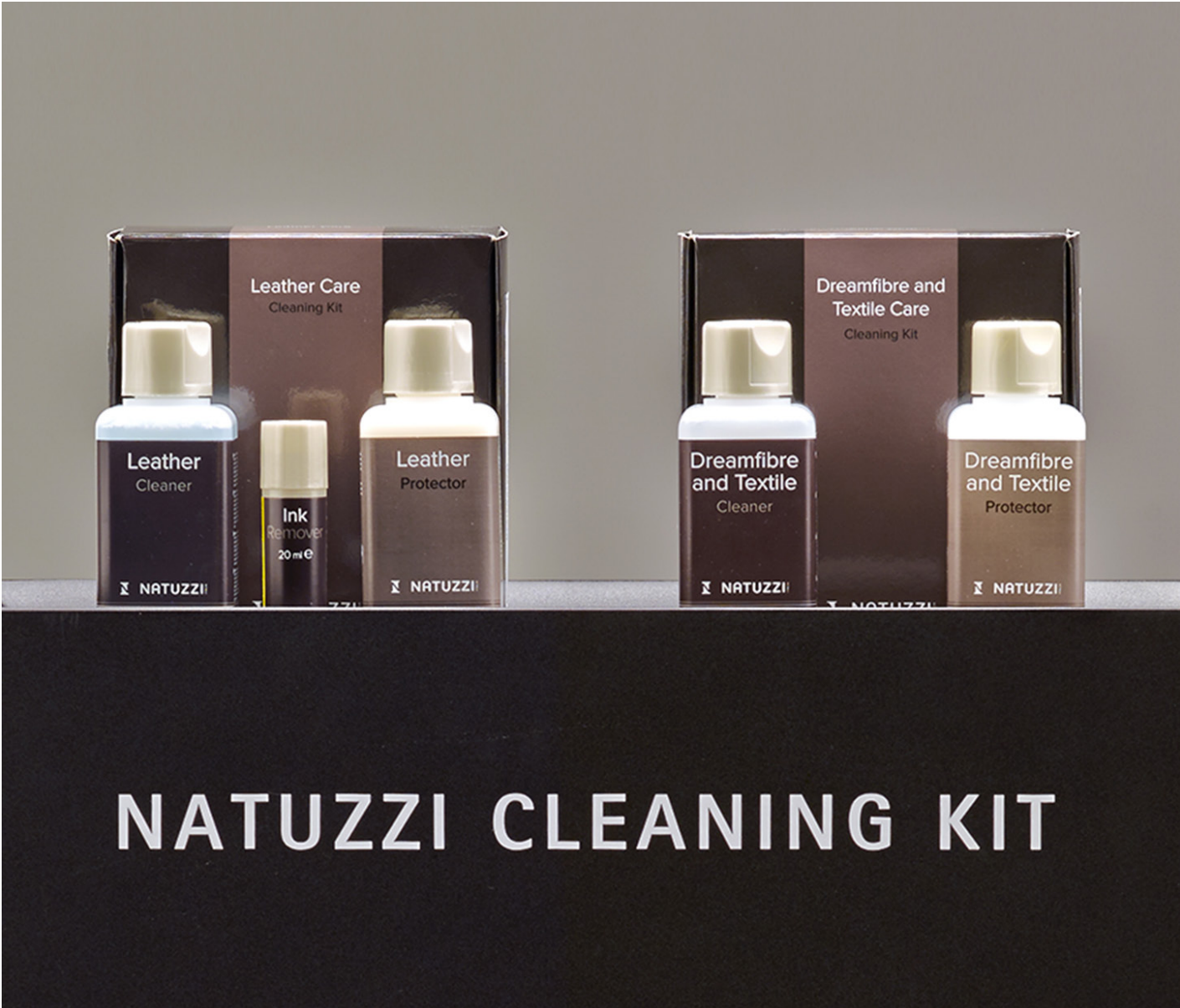
■ J005PX0 (1 pcs) / K005PX0 (20 pcs) + J005MX0 (1 pcs) / K005MX0 (20 pcs)